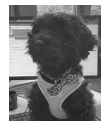
PENNY WELLBEING DOG