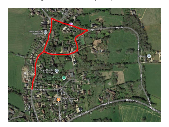
Parents' Association Update

Vicarage Lane and Keys Lane and you can cut through the Church yard. If we spread out the number of cars, it makes the village safer for everybody.